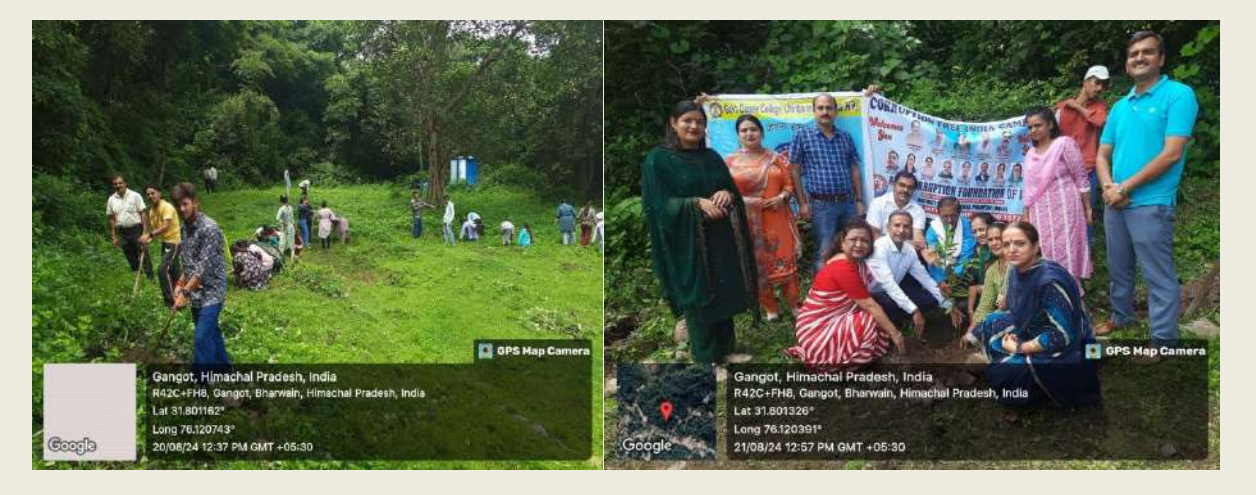
NSS Activities by Volunteers

The Government College in Chintpurni was established by Himachal Pradesh Government on April 26, 2017. Prior to its Governmental oversight, it was administered by a managing committee known as Swami Vivekanand Smark Smiti, Una since 1988. Affiliated with Himachal Pradesh University, the College offers undergraduate programmes in Arts and Commerce. Additionally, it actively promotes student engagement in extracurricular activities such as NSS, Rovers and Rangers, Red Ribbon Club and Road Safety, fostering holistic development. Notably, Chintpurni is renowned for its Maa Chintpurni Temple, a significant pilgrimage destination and one of India's revered Shakti Peethas. Aspiring athletes find a platform at the College to hone their skills and pursue their dreams. Moreover, students facing financial constraints are supported in their pursuit of higher education, thereby catering to the educational needs of numerous individuals hailing from neighboring villages in the vicinity.