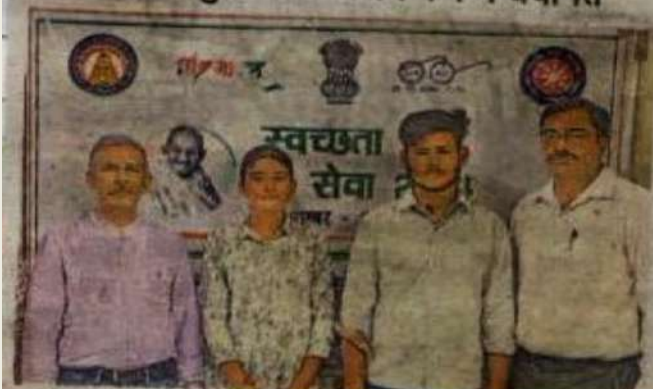
नशे के दुष्पभाव बता समाज को जागरूक