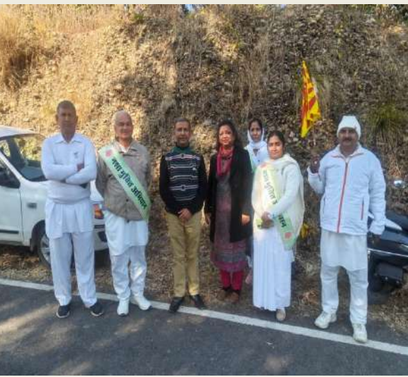
Activities by Red Ribbon and Red Cross Club