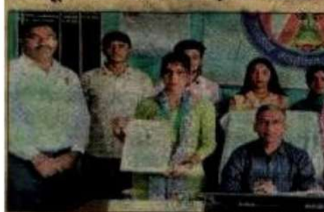
ना। राजकीय महाविद्यालय चिंतपूर्णी के विद्यार्थी प ल गतिविधियों में भी अपनी प्रतिभा का लोहा मनव