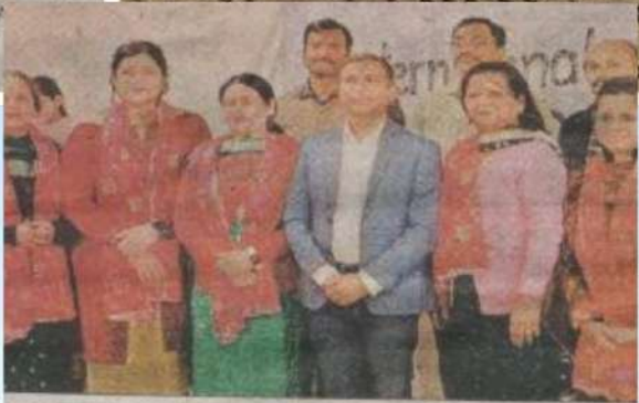
ज्यकीय महाविद्यालय चिंतपूर्णी में अंतरराष्ट्रीय महिला दिवस पर आयोजि कार्यक्रम में कॉलेज स्टाफ और अन्य।