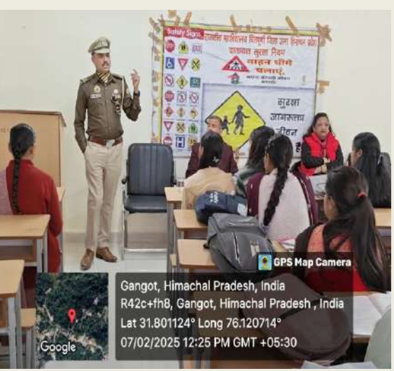
Activities under Road Safety Club