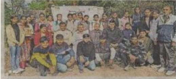
शिविर के दौरान प्राच्यापकों के साथ एनएसएस स्वयंसेवी = जानरण

चितपूर्णी : राजकीय महाविद्यालय सदुपयोग सामाजिक कार्यों में करने