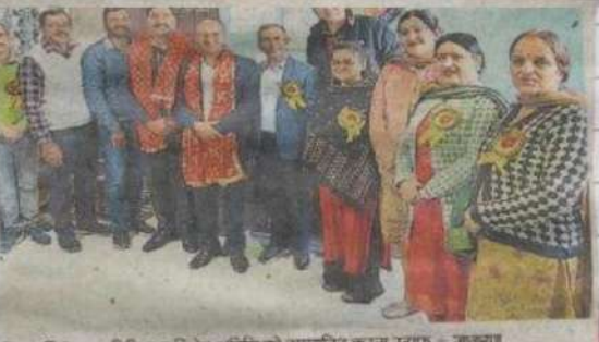
चित्रपूर्णी में मुख्यातिथि व व विशेष अतिहिंव को सम्मानित करता स्टाफ