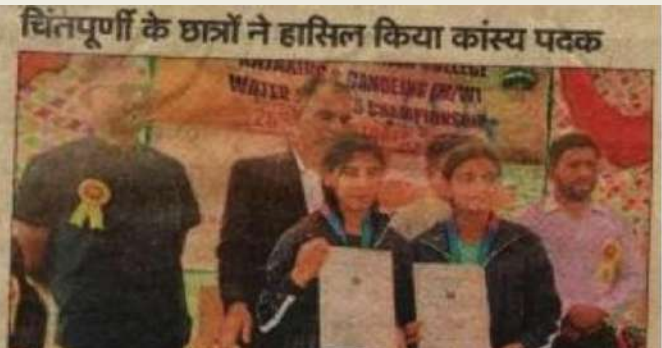
खिलाड़ियाँ को सम्मानित करते पदाधिकारी । राजकीय महाविद्यास्त्य जिल्ला के स्वर स

सामूहिक नृत्य में चिंतपूर्णी कालेज की छात्राओं ने पाया द्वितीय पुरस्कार